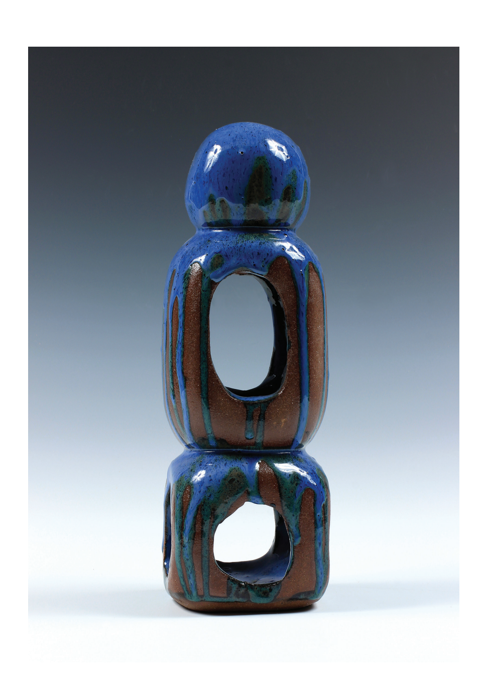
UNTITLED Jaden Medina-Torres ceramic