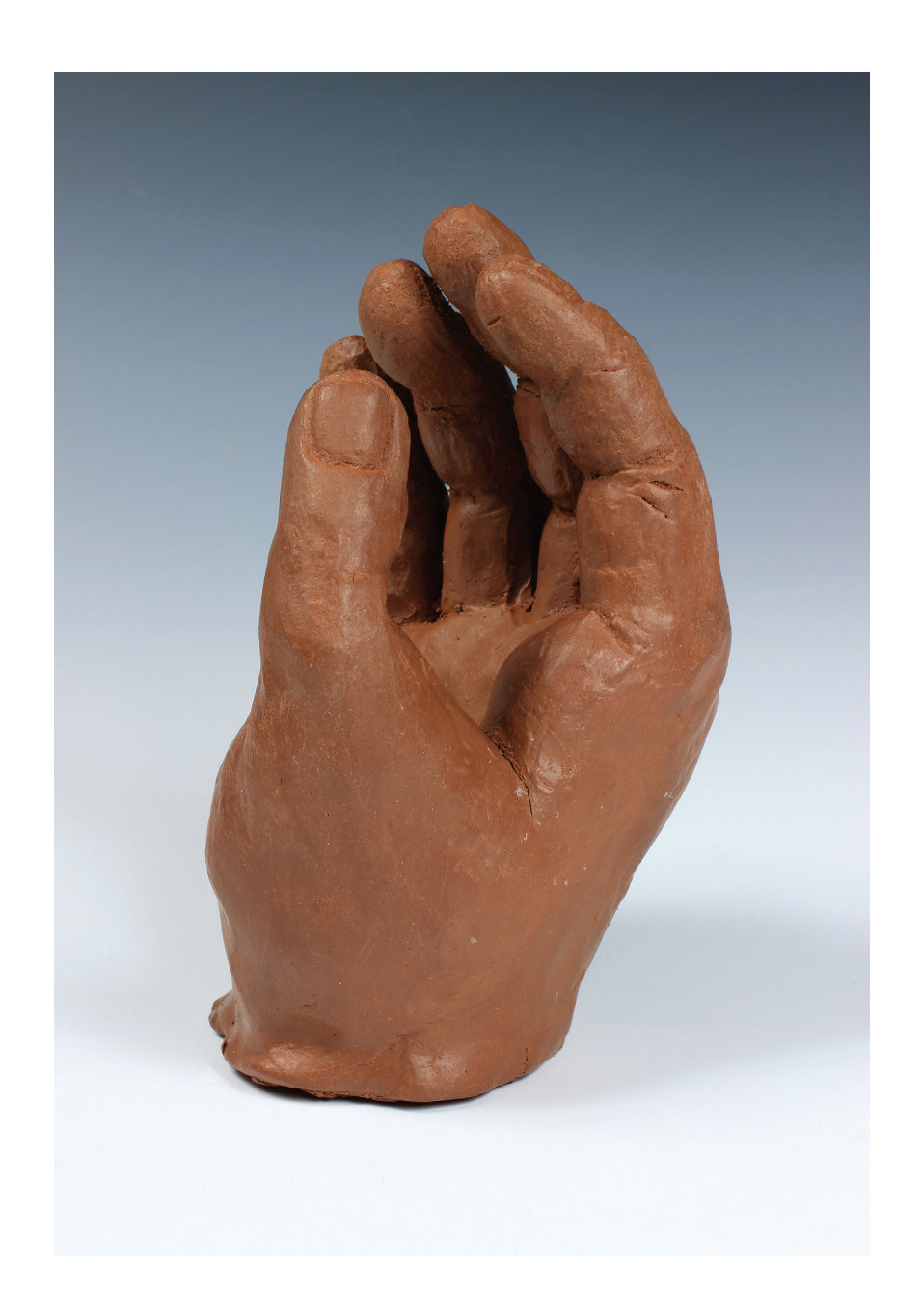
REACH Olha Olin ceramic