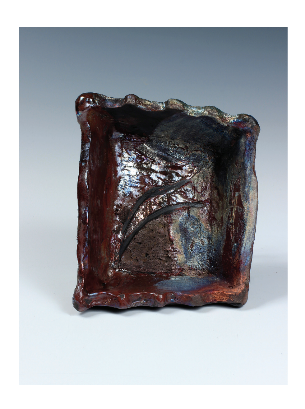
BURNT SKY CODY STARR ceramic (raku)