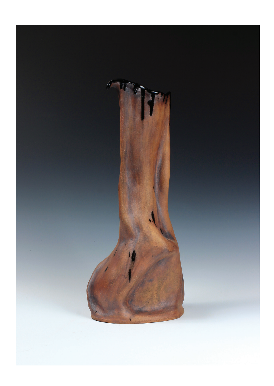
UNTITLED Andrew Ford ceramic