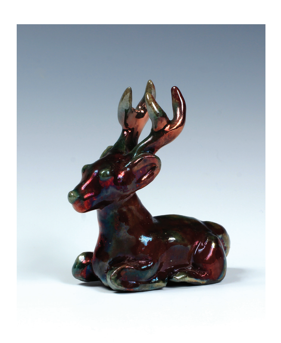
DEER ELIZABETH PORTILLOS ceramic (raku)