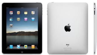
The Apple iPad is not a dedicated e-book reader, but it can be used to read e-books