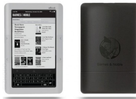
The Barnes and Noble Nook