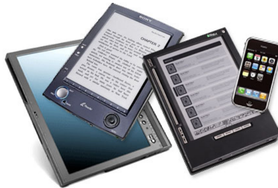
Various devices on which e-books can be read

E-books are often designed to be read on a dedicated e-book reader, but they can also be read on computers and some phones. Dedicated e-book readers usually use a technology called E Ink that resembles natural ink. E Ink is designed to lessen eyes train and work well bright light, as they don't get washed out